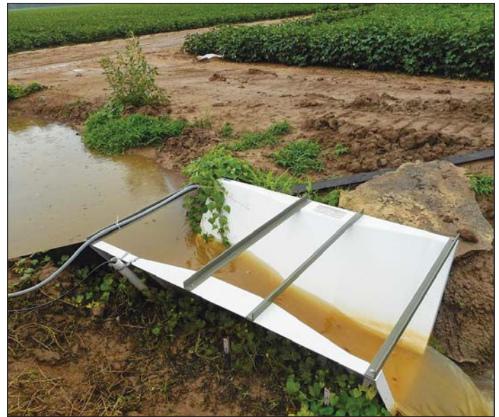
Flumes to measure discharge from fields near Wedington, Arkansas (left) and Dumas, Arkansas (right).

allow for the determination of “tail water” losses from irrigation and/or rainfall.