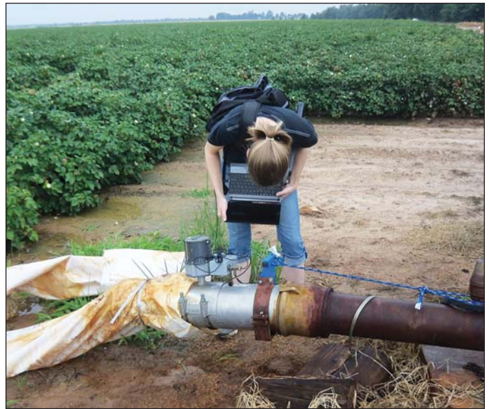
Automated sampler collects water during runoff at Atkins, Arkansas (left) and in-line water flow meter for irrigation water input (right), at Dumas, Arkansas.