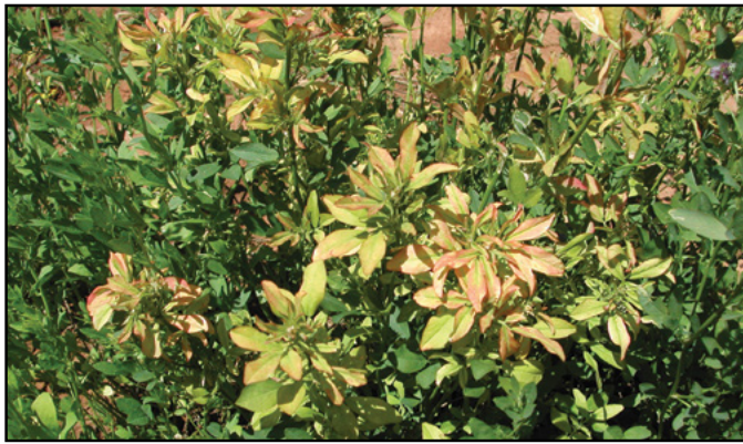
Boron deficiency in alfalfa is often seen

Corn: narrow white to transparent lengthwise streaks on leaves, multiple but small and abnormal ears with very short silk, small tassels with some branches emerging dead, and small, shrivelled anthers devoid of pollen.