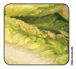
Tip burn in romaine lettuce is associated with inadequate calcium uptake.