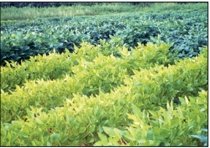
Soybeans showing Mo deficiency in the foreground.

In many soils, application of a liming material to increase pH will release Mo from insoluble forms. For example, a study showed that addition of lime alone resulted in the same soybean yield as when Mo fertilizer was added to unlimed soil<sup>2</sup>. However, the chemical release of soluble Mo following lime application may take weeks or months to occur.